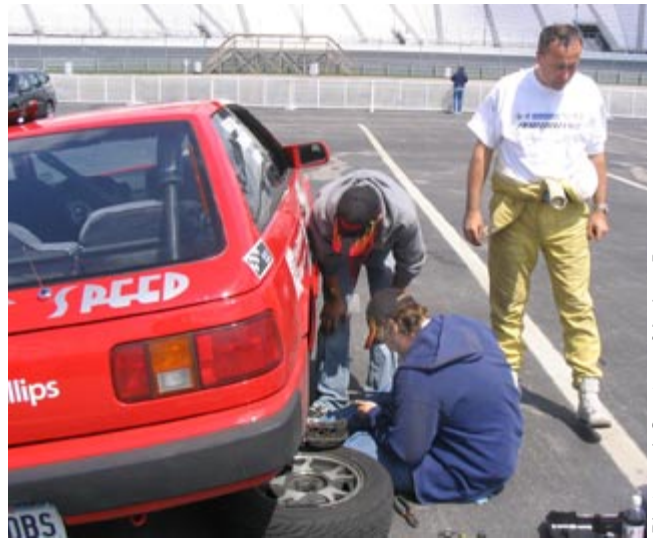
Working on the brakes on the Impulse became a routine activity.